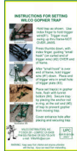
Shown without plastic cover